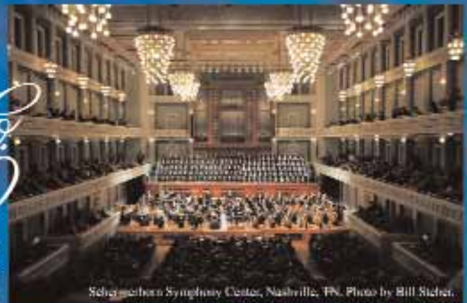
Schirmer Center Symphony Center, Nashville, TN.